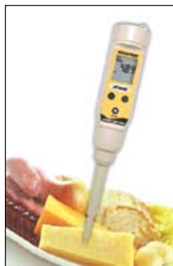
Left: Waterproof pH Spear

Food: Open-pore sensor enclosed in a resilient engineered plastic body makes it ideal for piercing solid or semisolid food samples such as cheese, meats, ice cream, salami, bread, fruits, and similar samples.