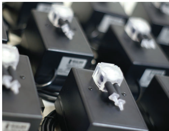
Dispense small volumes with the SP100.100 peristaltic pump