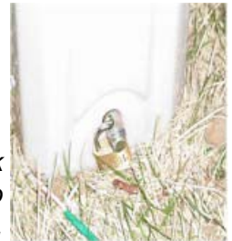
Anti-theft lock secures sign to base (right).